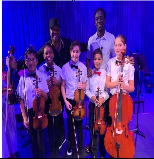
North Andrews Gardens Elementary Students Rehearsing for Black Violin Performance in Washington, D.C.!!